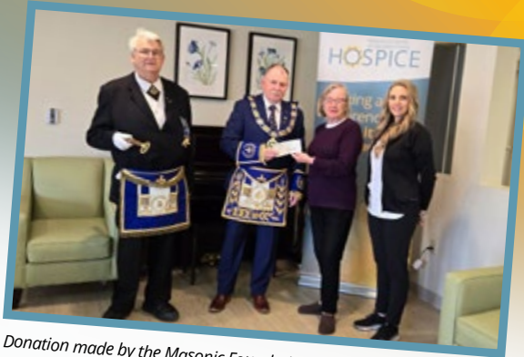
Donation made by the Masonic Foundation of Nova Scotia

Programming offered over the last year included the family assistance program, music therapy and equipment rental. Other much needed comforts of home offered to the delight of patients and families in An Cala and Hospice Cape Breton included sweets, soups and flower arrangements created through the baking and flower programs. With the goal of always ensuring patients and families continue to receive the highest level of care, the Society also supports other initiatives identified by Nova Scotia Health for palliative