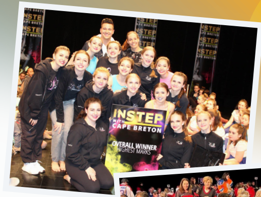
In Step Cape Breton

We could not do the work we do without our many community partners! To all those who have helped us to raise important funds, and to those who have donated and supported the Society, we thank you!